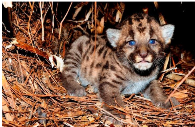
K304 at his den, June 06, 2010.

(Refer to the May and December 2011 Florida Panther Update issues for earlier articles about FP194/K304 on www.fws.gov/floridapanther/pantherupdate.html )