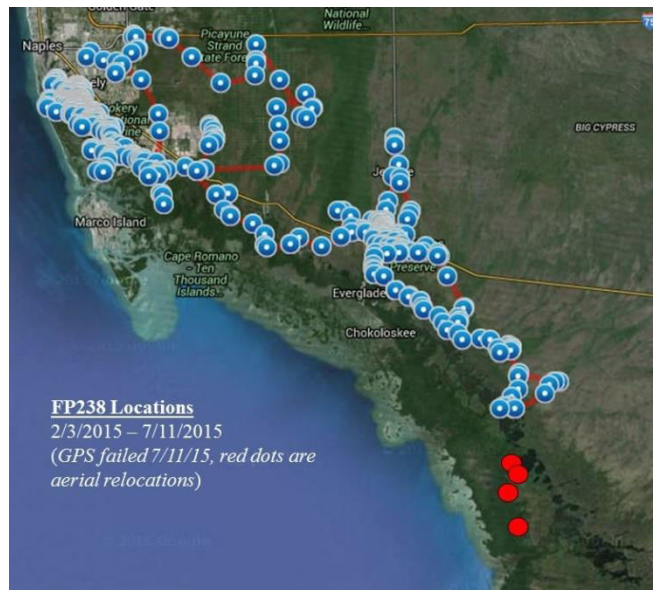
Figure 3. FP 238 Telemetry locations since capture 2/15. FWC

Young males dispersing out of their mother's home range often try to establish a home range in marginal habitat (the prime areas are defended by adult males). FP 238, a young male, captured in the Port Royal subdivision in February 2015 (Panther Update March 2015), has spent most of his time west and south of US 41 since his capture. He was released in Picayune Strand State Forest and headed south, and crossed US 41 within days. He spent a lot of time in Rookery Bay National Estuarine Research Reserve. Then he traveled southeast, between US 41 and the mangrove forest, through Collier Seminole State Park and Fakahatchee Strand Preserve State Park. He then spent some time in the area between Everglades City and Jerome on SR 29. Lately, he is back utilizing the edge of the mangrove forest, heading south into Everglades National Park to Lostmans River. Primary panther habitat is mostly above US 41. His travels illustrate the value of native habitats, not included in the identified panther habitat zones, especially to young maturing panthers. Unfortunately his collar failed in early October and biologists are no longer able to track him.