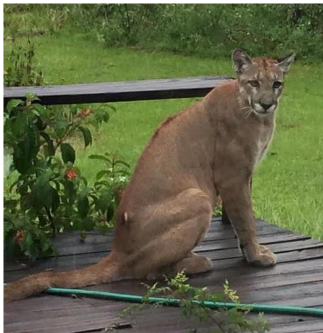
Figure 1. Panther on a back porch in Golden Gate Estates

Florida panthers are secretive and encounters with humans are rare. As secretive as panthers are, occasionally someone gets a good look at a Florida panther. Haley Price only had to look out on her porch in Golden Gate Estates last month and has a nice picture and a good story to boot (Figure 1).